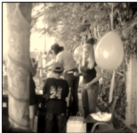
A face-painted smiling child – what a joyous site!